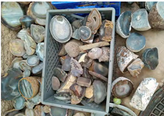
Lots of Brazilian agate.