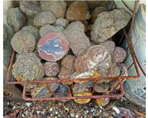
Crate of thunder eggs and geodes. There are at least six more 5-gal buckets full of 'em.