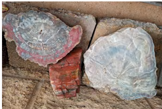
Some of the petrified wood available. Lots of chunks of colorful AZ material covering an 8-foot table and nearly filling up three milk crates.