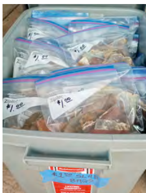
18 gal tub full of slab bags plus at least one dozen shoe box bins full of individually priced slabs at $1, $2 and $3.