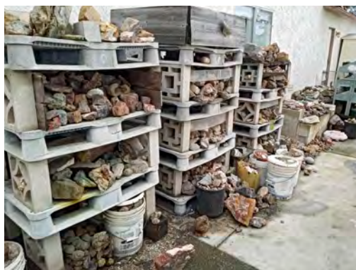
Racks on south side of rock storage area.