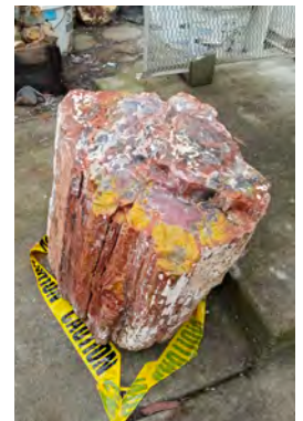
Big AZ petrified wood stump, approx. 400 lbs.