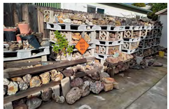
North side of rock storage area.