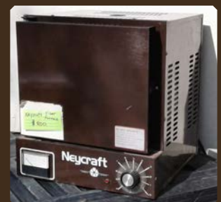
Silversmith Tools, Diamond Tool Co. Gem-Tec Lapidary Grinder, Bead Drill (lower left), Rock Tumbler (new), Neycraft Fiber Furnace (for casting).