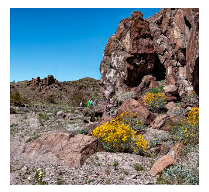
"Tight Squeeze Pass" in the North Cady Mountains in a superbloom year. March 30, 2019.